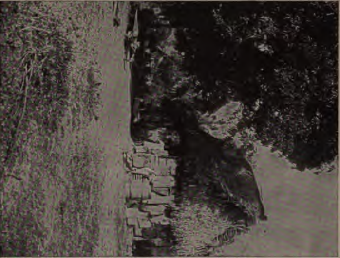
Squatter's hut built of dynamite boxes under a mango tree in the outskirts of Empire